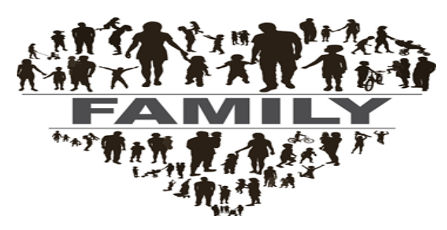
Happy Children, Happy Parents, Happy Life

casual chat or would like to arrange a meeting with me you can ask your academy staff to contact me and I will get in touch with you as soon as I can. I'm here to help parents, carers and children in any way that I can.